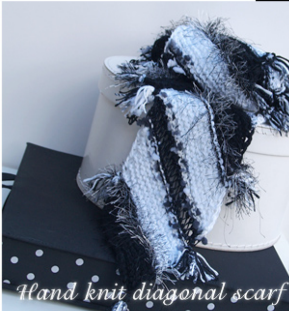
Hand knit diagonal scarf